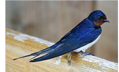
The barn swallow is the national bird of Estonia