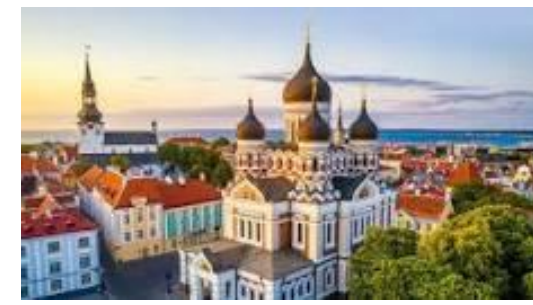
The capital city Tallinn