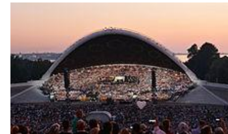
The Estonian Song Festival is UNESCO's Masterpiece of the Oral and Intangible Heritage of Humanity